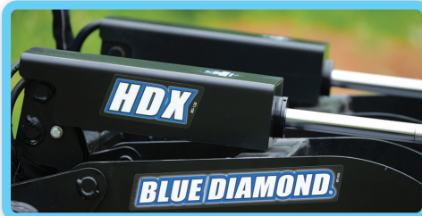
Reinforced covers protect fully welded hydraulic cylinders