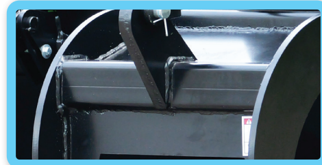
1/4" thick wall tube frame weldment