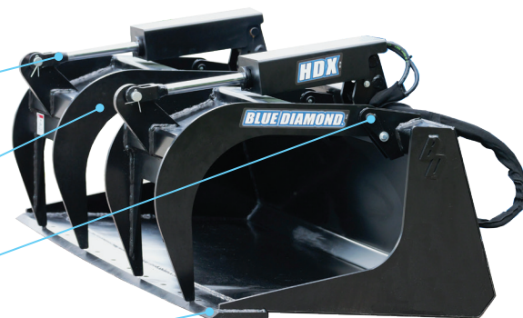
HDX GRAPPLE BUCKET