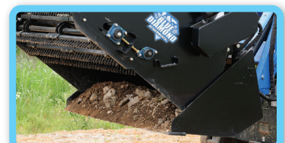
High capacity integrated bucket