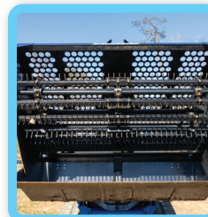
Hydraulic hood allows access to the bucket