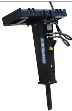
Skid Steer Mount