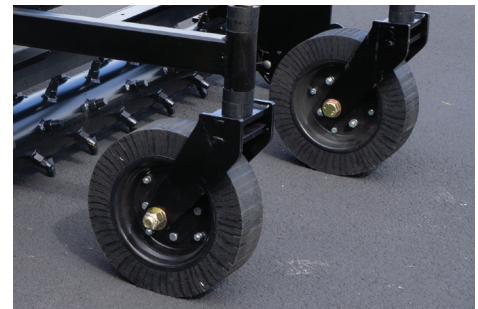
Airless tires - NO flats