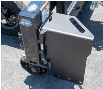
Reversible side shield

This Heavy Duty Series 2 Power Rake follows close on the heels of our previously released Severe Duty model. This lighter unit is suited to smaller frame skid steers and walk behind machines. The bolt-on mount allows greater flexibility for rental companies and dealers to have the correct model for the right machine, with mounts offered for mini and full size skid steer machines.