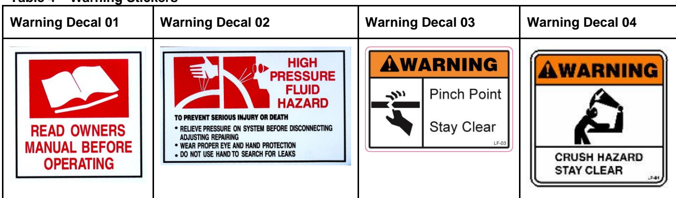
Table 4 - Warning Stickers