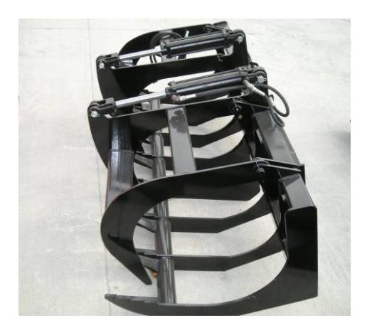
Figure 1 - Root Grapple

The root grapple attachment is vital in the tree industry and is quickly becoming a necessity among all contractors today. This unique root grapple is offered in a variety of sizes for a variety of applications.