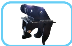
Full-sized excavator mounts available