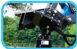
Mini excavator mounts available