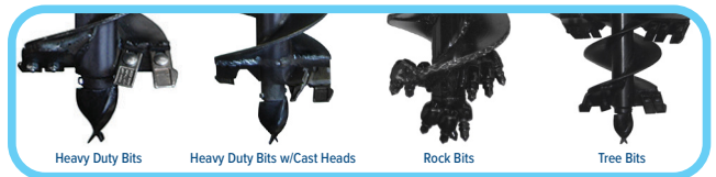
Heavy Duty Bits Heavy Duty Bits w/ Cast Heads Rock Bits Tree Bits