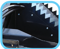
Removable sides to access blades