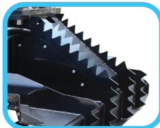
Serrated teeth to help move debris