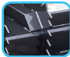
Serrated teeth to help move debris