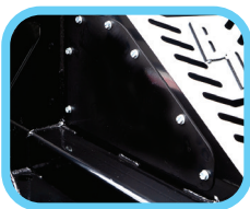
Removeable sides to access blades