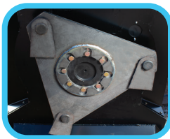
3 double-sided blades on a 3/4" thick blade carrier