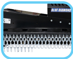
Chain guard options for 36" & 42"