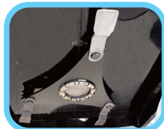
Three drop-down blades for a closer cut