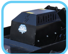
Fully enclosed motor