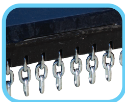
3 link chain on 50" model