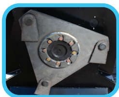
3 double-sided blades on a 3/4" thick blade carrier