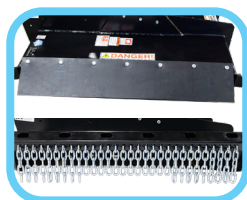
Deflector shields or chain guard options for 36" & 42"