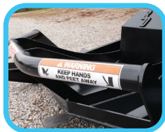
Heavy duty push bar for operator safety