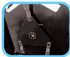
Three drop-down blades for a closer cut