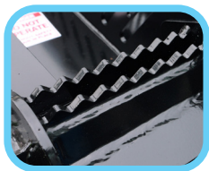
Safety step allows for easier cab access