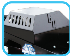
Fully enclosed motor cover