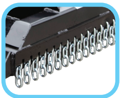
Front and rear chain guards