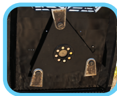
Three double-sided blades on a 3/4" thick blade carrier