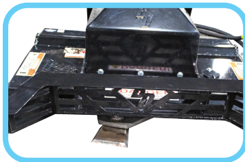
Open front exposes 2 1/4" of cutting blades