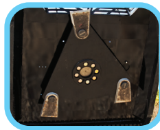
Three double-sided blades on a ¾" thick blade carrier