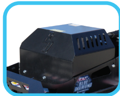
Fully enclosed motor cover