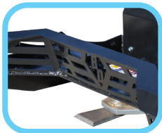
Reinforced push bar