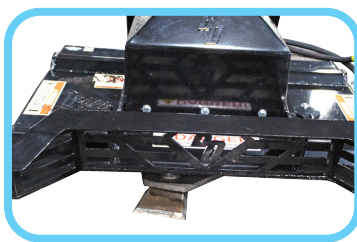
Open front exposes 2 1/4" of cutting blades