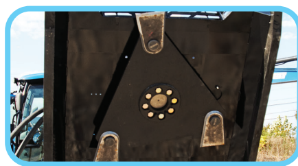
Three double-sided blades on a 3/4" thick blade carrier