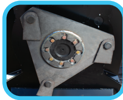
3 double-sided blades on a 3/4" thick blade carrier