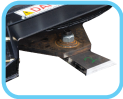
Open sides expose blades for more aggressive cutting