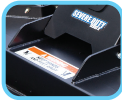
3/16" thick reinforced steel deck