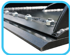
Bolt-on edge for added protection and strength