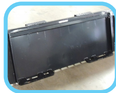
Closed-in quick attach to protect operator from debris