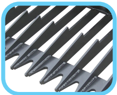
3" spacing between tines