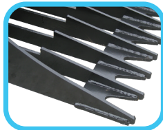
Laser-cut cutting edge gussets and reinforced tine tips