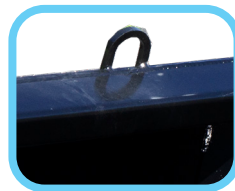
D-Ring for tie down or to lift heavy objects