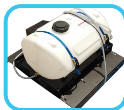
Water kit available