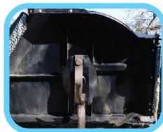
6 free-swinging blades