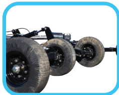
Four flat-free tires