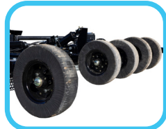
Six flat-free tires