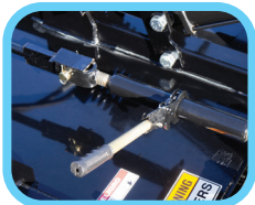
Easy leveling adjustment