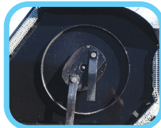
6 free-swinging blades