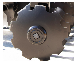
18" notched disc blades