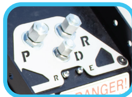
Labeled hose & grease ports