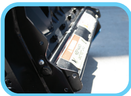
Manual adjustable gate