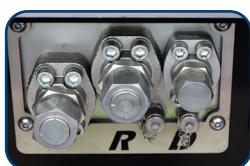
Labeled Hose Ports