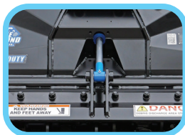
Hydraulic adjustable door