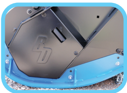
Adjustable skid shoes