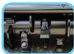
Teeth with bite limiters