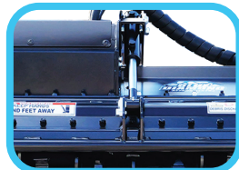
Manual or hydraulic gate