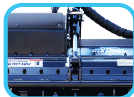
Manual or hydraulic door