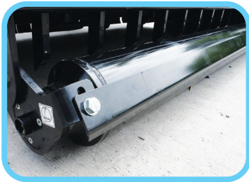
Adjustable rear roller