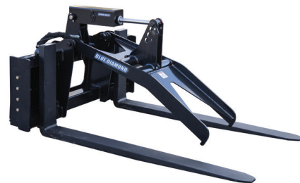
Grapple Fork - Severe Duty