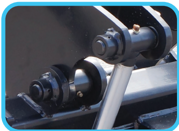
Pivot points have grease ports