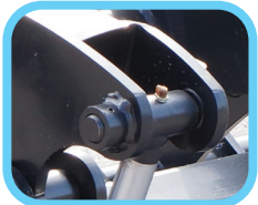
Greaseable 1" pivot pins