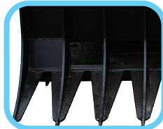
Eight heavy duty 1/2" tines