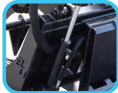
2" x 10" heavy duty hydraulic cylinders