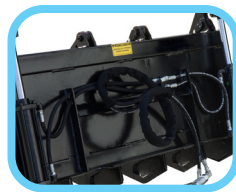
Solid-back frame for added strength