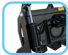
Heavy duty hydraulic cylinders with enclosed covers