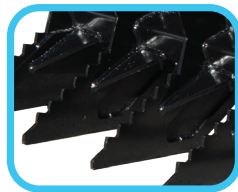
3/4" serrated bottom tines spaced 9" apart