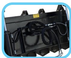
Solid-back frame for added strength