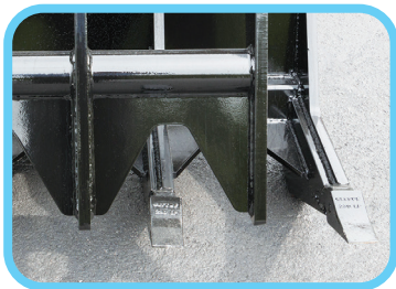
Eight replaceable teeth