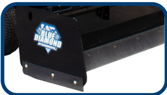
DUAL CUTTING EDGES & ADJUSTABLE SIDE EDGES

Ribs inside to strengthen floor & back. 3/16" wrap, 3/8" edge