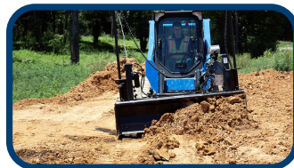
8" BLADE ARTICULATION