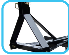
Category 1 quick hitch