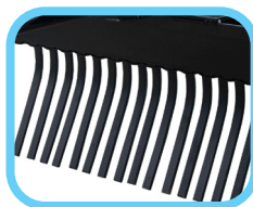
6 tines per foot