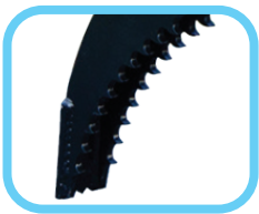
Serrated clamps to hold onto large logs