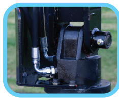
Hose shield to protect hoses against flying debris