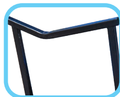
49" curved backrest