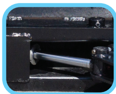
Heavy duty hydraulic cylinder