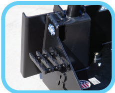
Protected cylinder cover