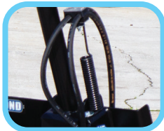
Hose saver spring