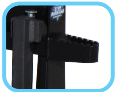
Safety steps for easy cab access