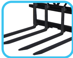
Four tines to move large amounts of masonry materials quickly