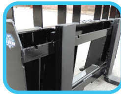
Adjustable tine width