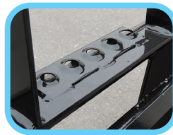
Tread plate gives safe footing