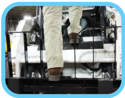
Walk-through frame allows easy cab access