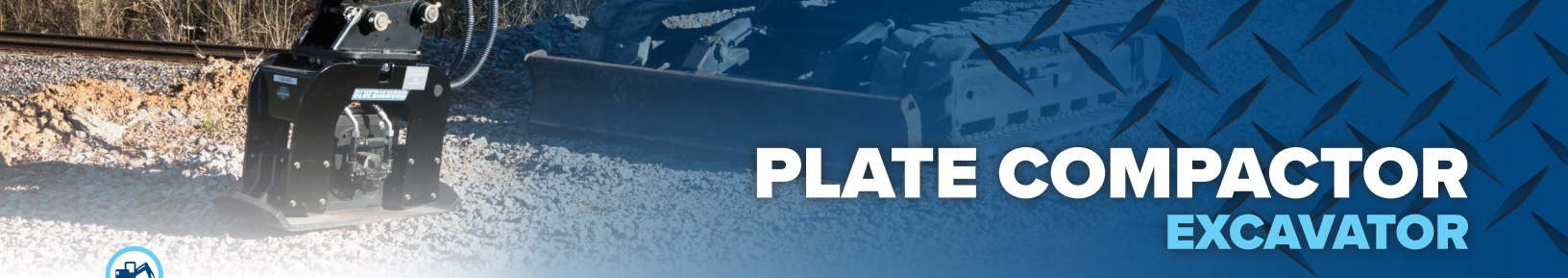
PLATE COMPACTOR EXCAVATOR