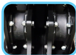
Easy to replace shock absorbers