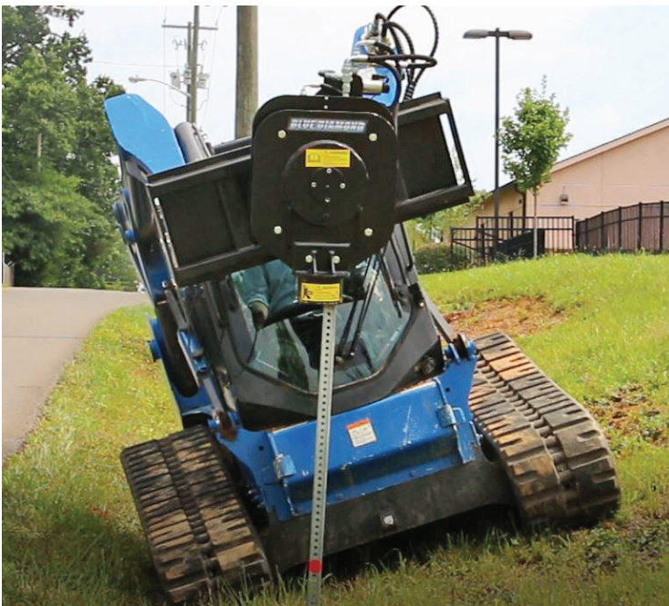
Tilt function to get post straight on slopes

Do not let the size of the Blue Diamond® Vibratory Series 2 Post Driver fool you—this unit packs more of a punch than most hammer-style drivers on the market. By using hydraulic orbital technology, this vibratory post driver uses your machine’s auxiliary flow in the most efficient way.