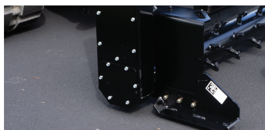
SIDE PLATE WITH SKID SHOE