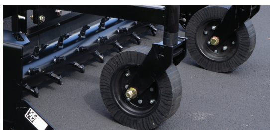
AIRLESS TIRES - NO FLATS