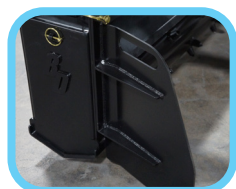
Reversible side shields

Designed for mini skid steers, the Mini Power Rake is available with fixed, manual, or hydraulic angle adjustment and a versatile bolt-on mounting system. Heavy-duty greaseable components and no-flat airless wheels provide long-lasting durability and dependable performance.