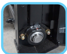
Heavy duty protected bearings