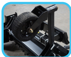
Flip up wheels